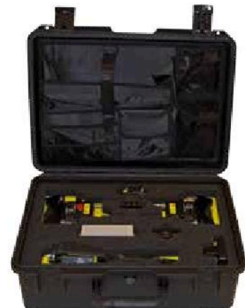
The LineLazer Alignment kit is complete with instrument, alignment sensors, brackets, chains, rods, cables and a tape measure, all in an IP67 carrying case.