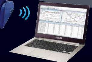
Windows 10 Compatible Software