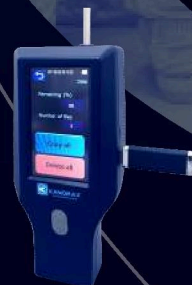
Sleek/Modern Instrument Design